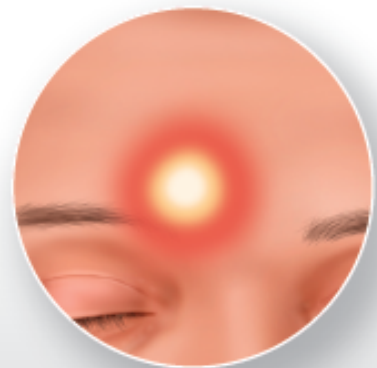
High-intensity output for transcutaneous confirmation

Compatible with working lumen instruments with an internal lumen diameter \geq 0.035" and a length \leq 27.5\text{cm}